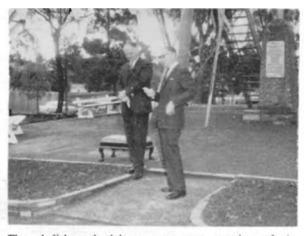
The obelisk and slab commemorate erection of the Tower in 1931. Improvements also seen are re-surfacing of obelisk, rock edging, filling and surfacing of area, rose gardens drinking fountain, seats and some playground equipment.